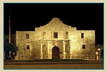
The Alamo, the most visited attraction in San Antonio, is just 3 blocks away from the hotel.