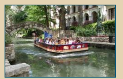
COCKTAIL CRUISE Monday, October 15 Along the Riverwalk Leaving from the Holiday Inn 6:00 to 7:00 pm