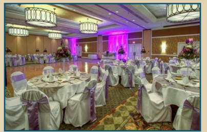
BANQUET Tuesday, October 16 Tango Ballroom 6:00 pm