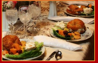
BANQUET Tuesday, September 12 Social Hour 6:00 pm Dinner 7:00 pm Capital Ballroom

LUNCHEON Monday, September 11 11:45 am – 1:00 pm Capital Ballroom